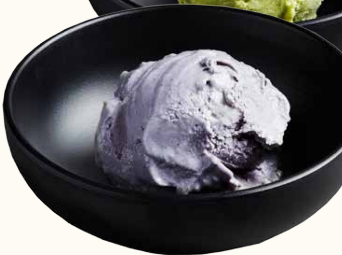
Goma (Black Sesame) Ice Cream