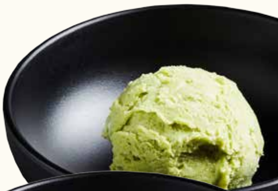
Matcha (Green Tea) Ice Cream